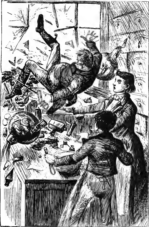
Mr. Cophagus is Tossed Through His Own Shop-Window.